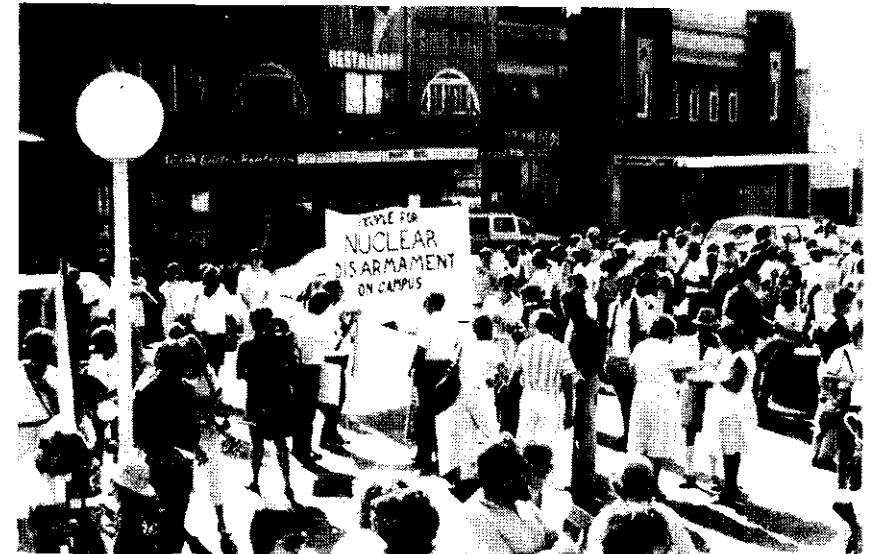
Members of PND on Campus organising before the rally in Newcastle on April 15.

Activities undertaken by PND on campus include joining the reported 4,000-strong crowd at the rally in Newcastle on April 15, organising the visit by the peace campaigners, Helen and Bill Caldicott, which attracted nearly 1,000 people, presenting two peace activists as speakers