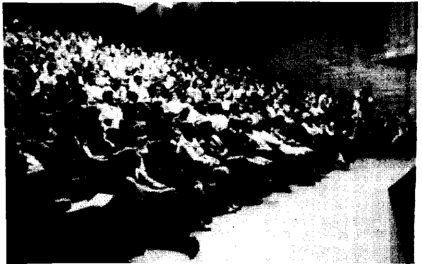
A packed Drama Theatre listens to the Minister.