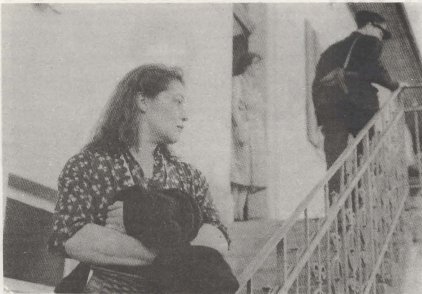
Still from the Boat is Full (Switzerland) which will be screened with Beads of One Rosary which opens the Travelling Film Festival at the Civic on September 11.

To conclude, Dr. Caelli demonstrates how geometric properties of various visual phenomena can be interfaced with current visual information processing models and so integrates two apparently different approaches to perception.