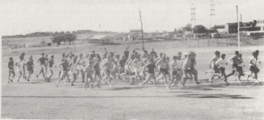
This is the field at the start of the Campus Scamper on July 22. The long course field had a 6.4 kilometre jog in front of them and the short course field ran 4.6 kilometres.