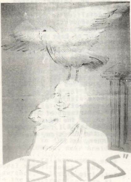
ARTS DRAMA THEATRE, NEWCASTLE UNIVERSITY JULY 20th to AUGUST 1st - AUGUST 24th to 26th at 8.15pm

One-day symposium, Trading With Japan , providing practical advice for Hunter Valley businessmen whose work will require them to deal extensively with Japan. Room R02.