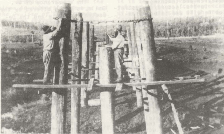
Bridgebuilders at work on the new railway near Lismore in northern New South Wales, early in the 1890's.