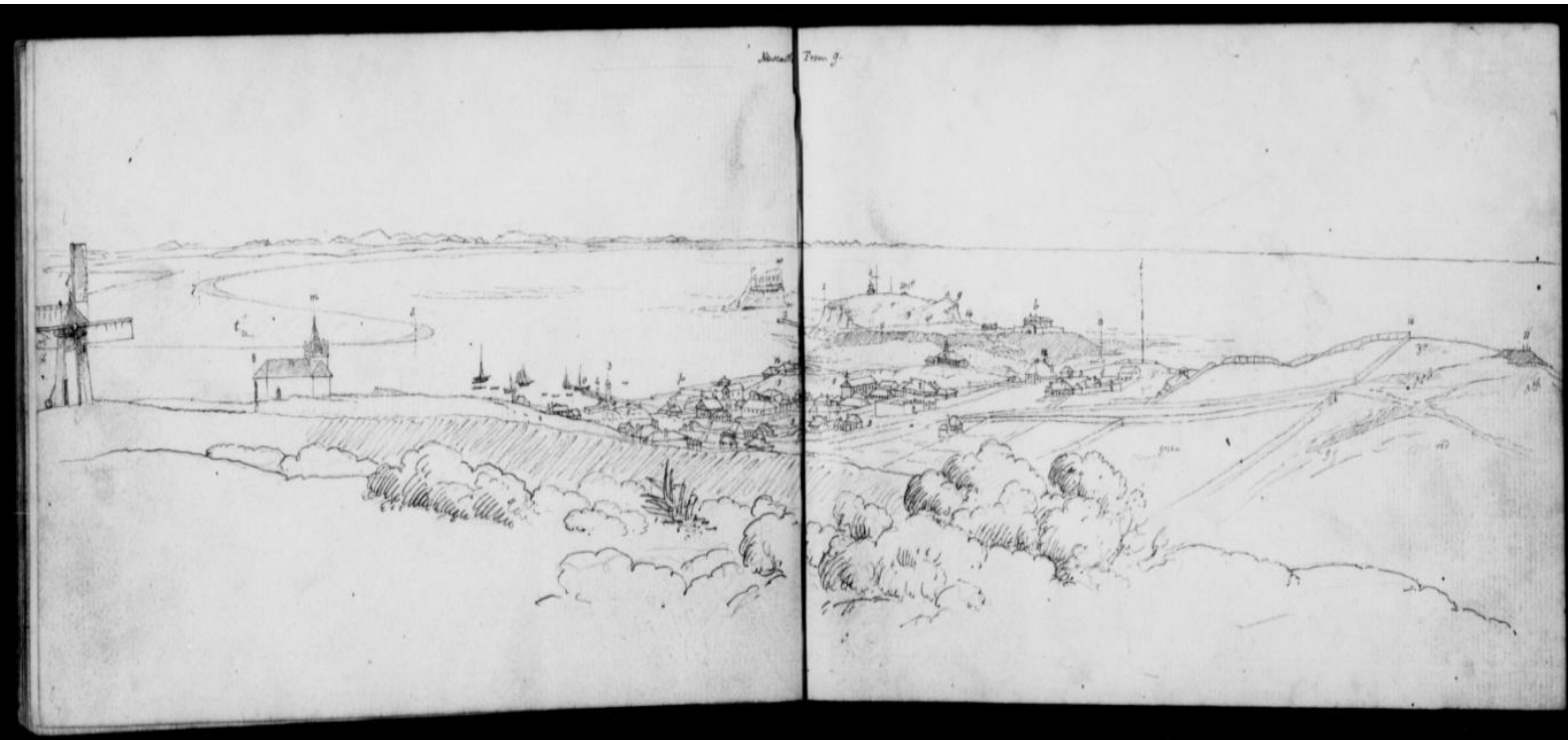
1828-1830. Mitchell, Sir Thomas Livingstone (1792-1855) Field, Note and Sketch Book, 1828-1830