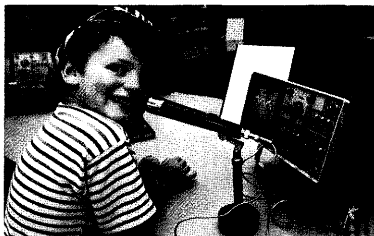
This youngster enjoyed his visit to Open Day and watched a Sonograph register the characteristics of his speech.

"It is a very broad course with a problem-based learning approach incorporating a strong link between theory and practice. It has been designed to meet the academic requirements of the two governing bodies, the Australian Institute of Building and the Australian Institute of Quantity Surveying.