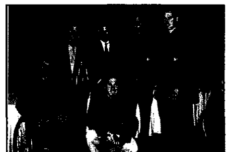
2000 Sports Person of the Year Finalists

The Sports Union's Annual Blues Dinner will be held at the University Union on Friday, 31 August 2001. Awards will be presented to Blues, Colours and the Sports Person of the Year. Tickets are available by calling 4921 6960.