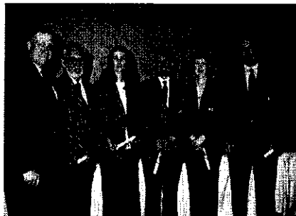
Colours Recipients for 1999