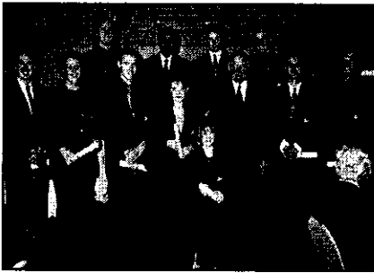
Blues Recipients for 1999