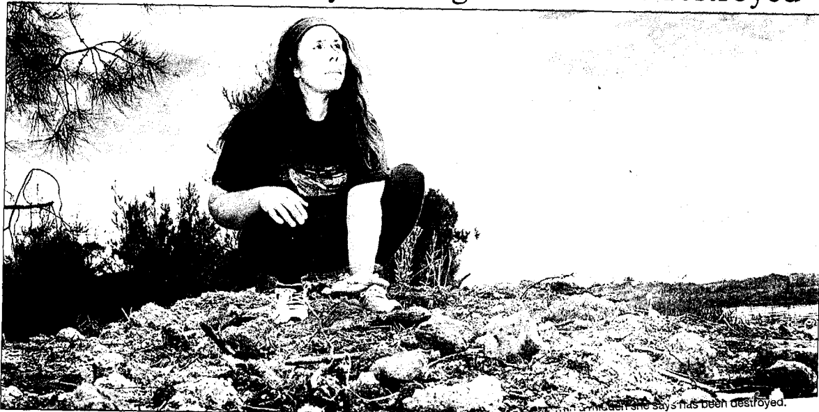
Dumped: Maialang Aboriginal Heritage Society member